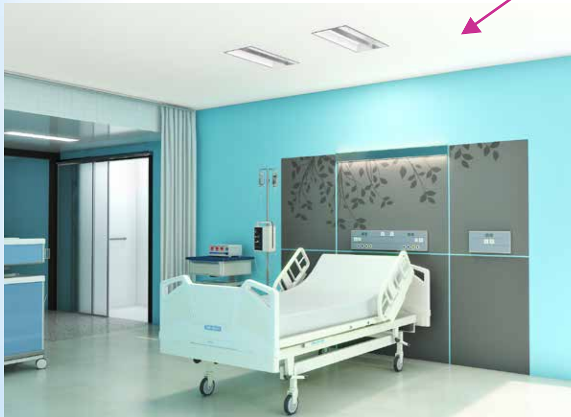
Shown here using two 1X2's (pair)