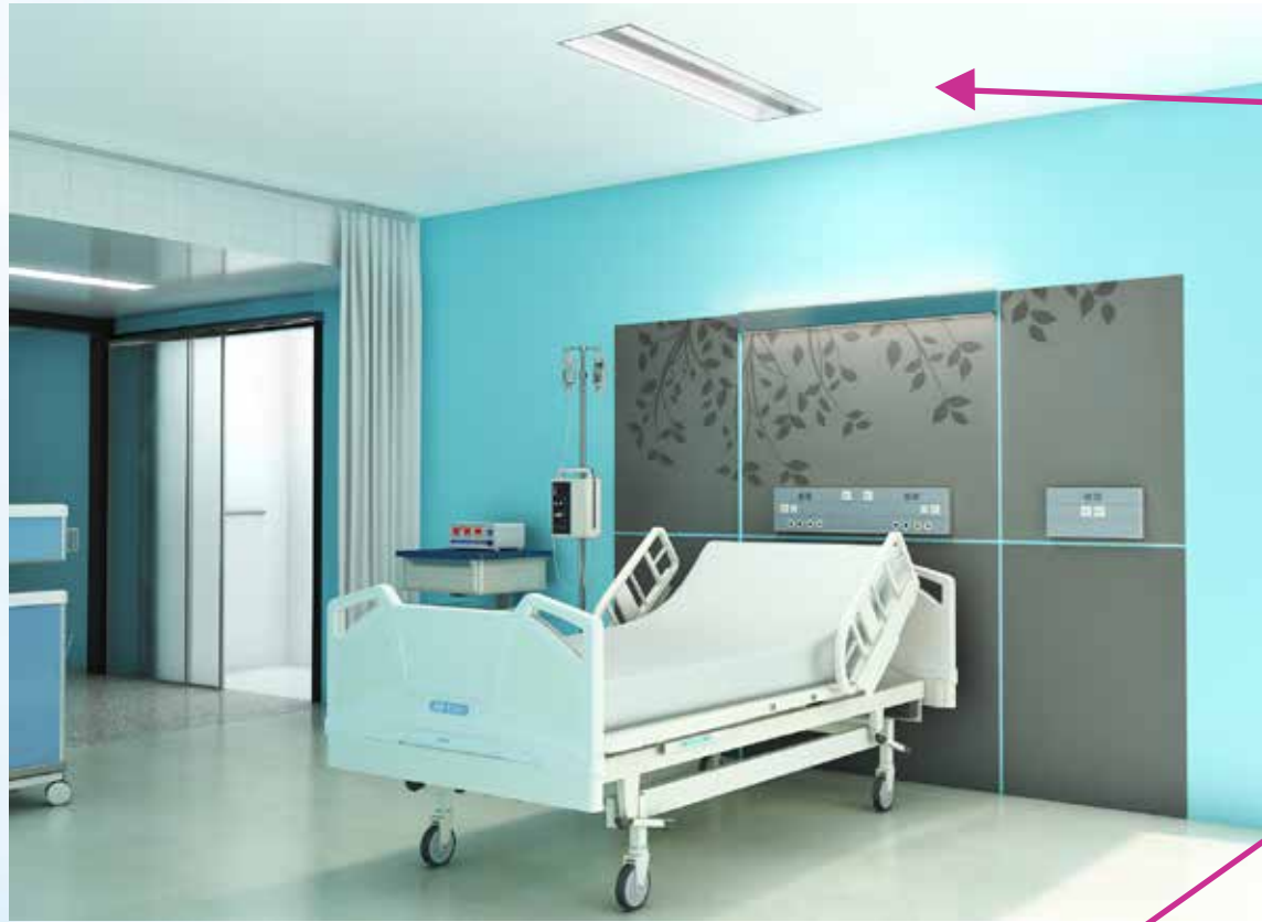
Shown here using 1X4