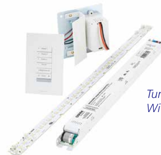
Tunable White System With Wall Station